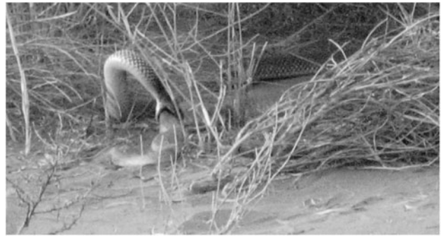
PLATE 1 Mulga snake Pseudechis australis biting a reintroduced woma Aspidites ramsayi at the Arid Recovery Reserve in South Australia (Fig. 1).

The most noteworthy outcome of this study was that all released woma pythons were dead between 41 and 123 days following release, either definitely or most likely killed by mulga snakes. Three python mortalities were attributed to at least two, probably three, different mulga snakes. Two of these womas were eaten by different mulga snakes that continued to be radio-tracked until they excreted their transmitters 33 and 23–27 days later. The other woma (#98) was observed being repeatedly struck and dragged around by a mulga snake but was not swallowed (Plate 1). Three other womas were most likely killed by mulga snakes that were observed entering woma burrows immediately before their death (#97) or they were located near death or dead with severe bruising and/or heart and lung damage consistent with mulga snake envenomation (#91 and #95). Two other womas (#93 & #96) were removed from burrows in a decomposed state several days after many snake tracks were observed at the burrow, consistent with the sign left by a confirmed mulga snake attack followed by regurgitation of the woma. The final woma transmitter (#99) was lost after it had moved widely on a swale for several days without being sighted, which was consistent with the movements of both mulga snakes known to have consumed womas (see below). We assume that this woma was swallowed by a mulga snake shortly before the long-distance movements of its transmitter commenced.