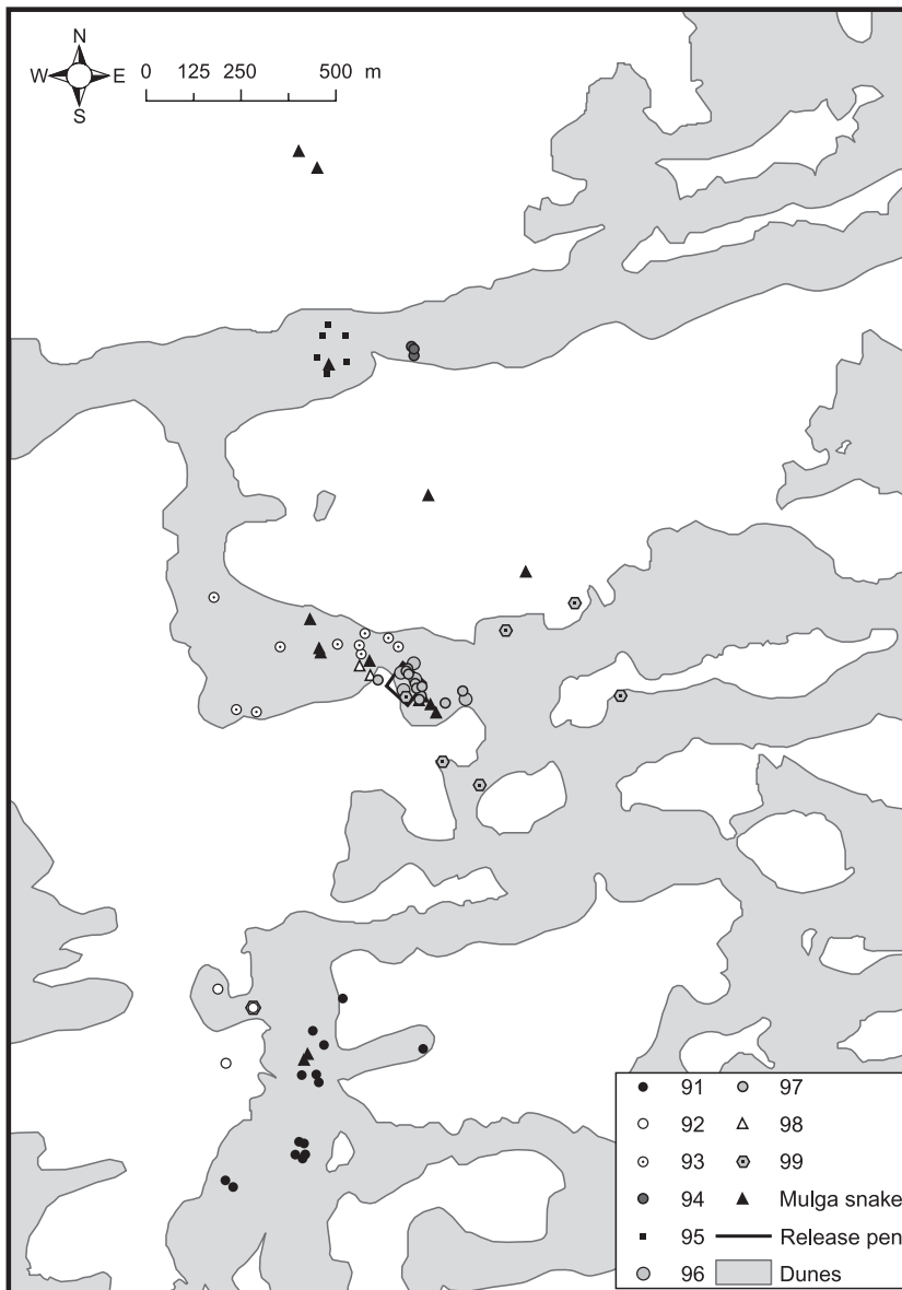
FIG. 1 Map of part of the Arid Recovery Reserve showing locations where nine woma pythons Aspidites ramsayi (#91–99), and subsequently mulga snakes Pseudechis australis that predated three pythons, were found.

P = 0.000 ), with rodent tracks ( 70.4 \pm SE 3.8\% ) occurring more frequently than all other kinds of tracks (Fig. 2). This suggests that womas in both release groups had access to ample potential prey.